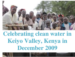
Celebrating clean water in Keiyo Valley, Kenya in December 2009